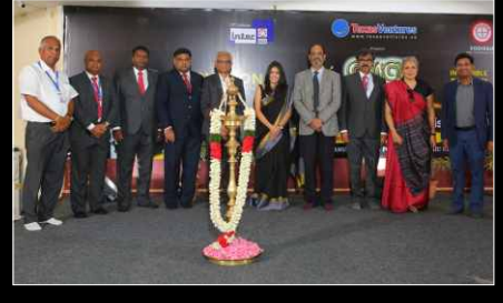
GMCV 2030 CHIEF GUESTS, GUESTS OF HONOUR & ORGANISERS