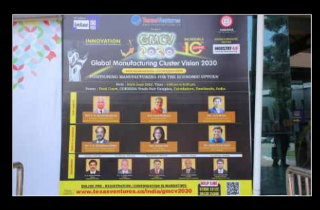
Entrance Arch @ Codissia Trade Fair Complex