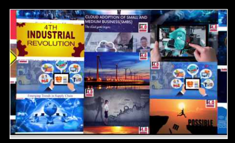
Visual Interlude of INDUSTRY 4.0 GMCV 2030 Online E-Magazine Partner