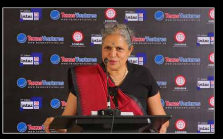
"GMCV 2030 Conference Presidential Address" by Chief Guest Smt. SONALI KULKARNI